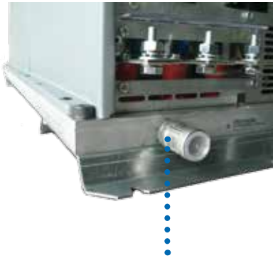
Detail of cooling liquid input: 4...35 l/min (based on drive size).