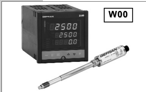
The rigid stem configuration makes installation fast and easy.