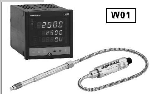
The flexible configuration is designed for applications requiring further thermal isolation or where installation would be otherwise difficult or impractical.